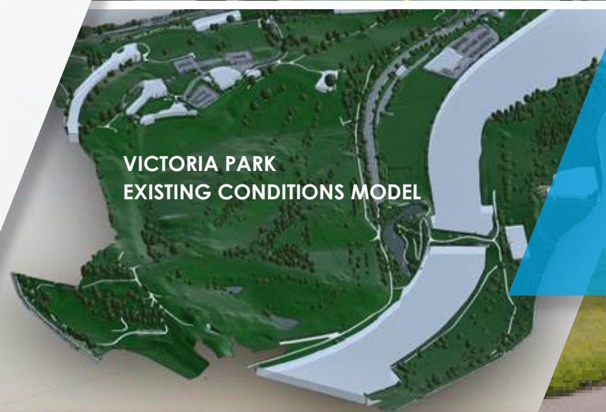
VICTORIA PARK EXISTING CONDITIONS MODEL